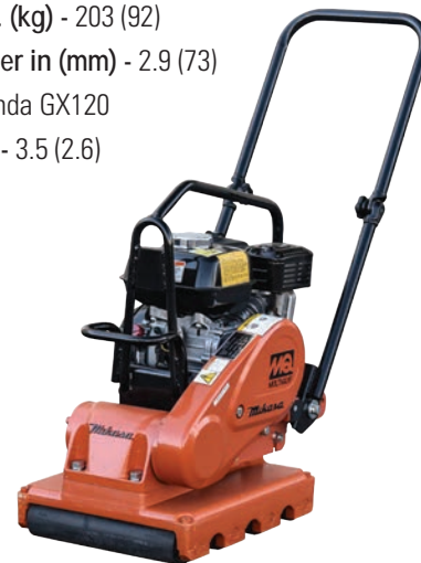
Plate size WxL in (mm) - 12.60 x 17.05 (320 x 433) Centrifugal Force lbs. (kN) - 2,270 (10.1) Exciter Speed VPM (Hz) - 5,600 (93) Operating Weight lbs. (kg) - 203 (92) Rubber Roller Diameter in (mm) - 2.9 (73) Gasoline Engine - Honda GX120 HP Rating BHP (kW)* - 3.5 (2.6) Rollers - 4