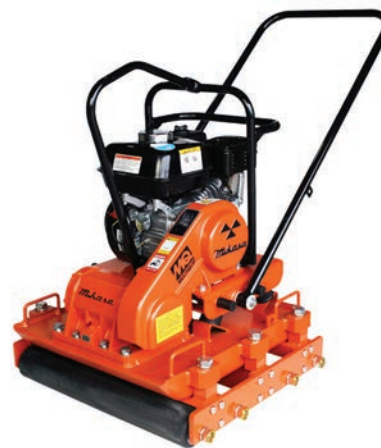
Plate size WxL in (mm) - 21.89 x 29.62 (556 x 752) Centrifugal Force lbs. (kN) - 3,417 (15.2) Exciter Speed VPM (Hz) - 5,800 (97) Operating Weight lbs. (kg) - 348 (158) Rubber Roller Diameter in (mm) - 3.3 (86) Gasoline Engine - Honda GX160 Rollers - 4