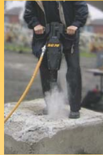
Detachable gas tank