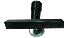
Slotted Magnetic Nozzle 300895 12-inch-wide (305 mm) nozzle with magnetic base.