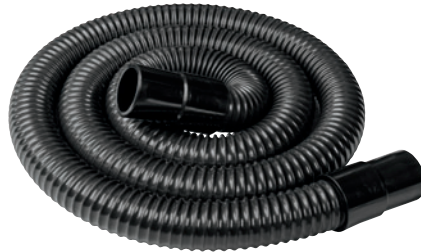
Extraction Hose 300896 17-foot (5.2 m) length 300897 34-foot (10.4 m) length