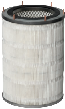
FilTek™ XL Filter 301267 Manually cleanable flame-resistant (FR rated) replacement filter for FILTAIR 130.