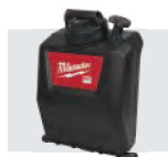
MI-49492010 WATER TANK