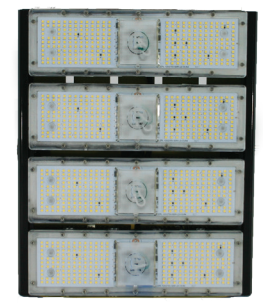
LE980LED Rugged, durable and weatherproof. No heat, instant start up