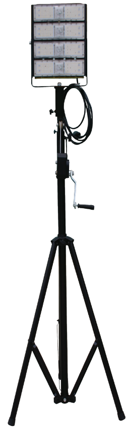
LE980LED-TRW Strong Tripod Mount Can reach 10 feet high!