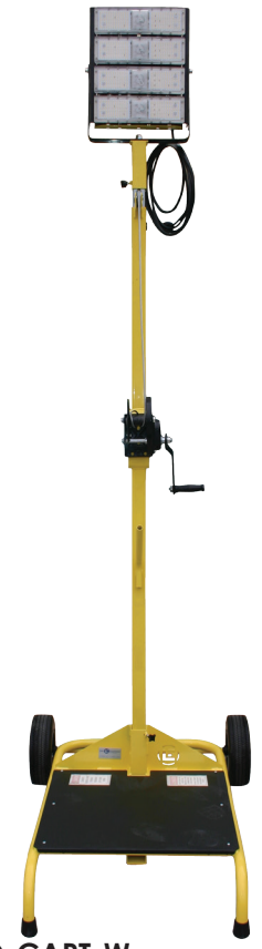
LE980LED-CART-W Single Head Cart with Winch Dual Head Option Available!